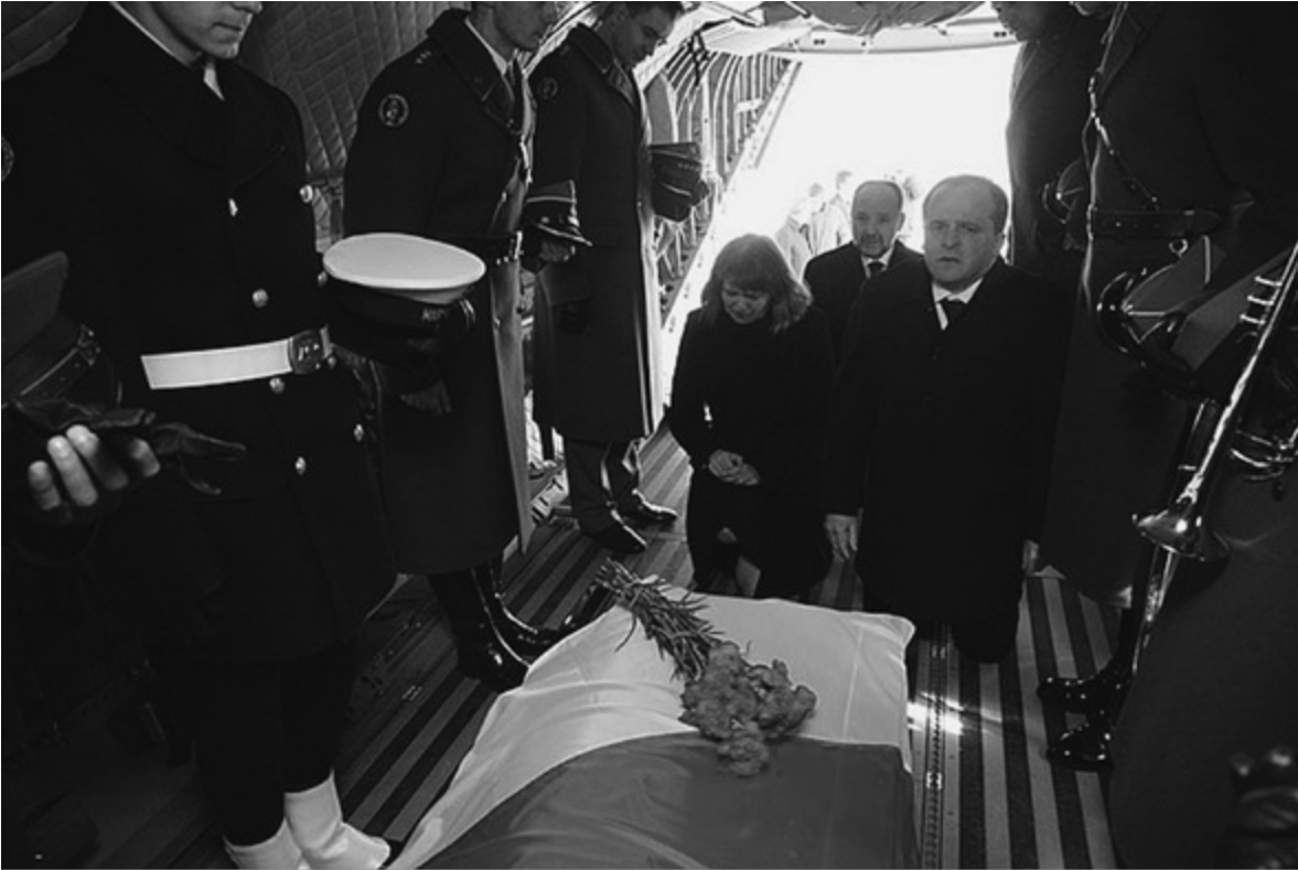
When the president of Poland died in a plane crash in Russia, the Polish media focused on conspiracy theories—only a few investigated.

'Most censorship is of an "inner" nature. Journalists self-censor because they are aware of their employer's political position and thus do not submit stories in opposition to it.'