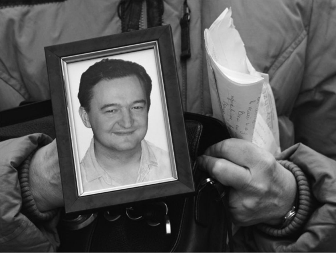
Sergei Magnitsky, a Russian lawyer who is believed to have discovered a major tax fraud involving police officers, was subsequently arrested on charges of tax evasion and died in pretrial detention in 2009.

'While journalists and bloggers in Russia risk their lives to reveal corrupt practices, there are ways that those living in free and lawful societies can aid their efforts.'