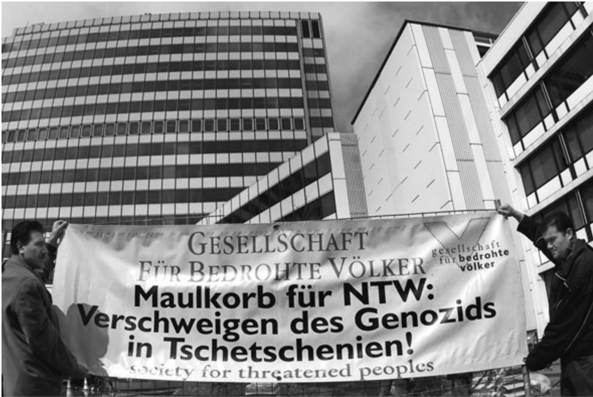
In 2001 free speech advocates demonstrated in Germany against Gazprom, a major Russian energy concern, when it took over a Russian TV company. Gazprom is partly owned by a German firm.