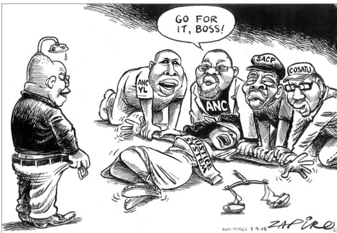
Sunday Times editorial cartoonist Zapiro depicts President Jacob Zuma unbuttoning his pants while members of his government hold down Lady Justice. Two years after it was published in 2008, Zuma sued the paper and the cartoonist for $700,000. The showerhead is a satirical reference to Zuma's statement in court that after having unprotected sex with an HIV-positive woman he showered to reduce the risk of infection. Reprinted with permission. For more Zapiro cartoons visit www.zapiro.com .

'South Africa's crackdown on press freedom comes at a treacherous time, as numerous countries have regressed, rather than progressed, on this front.'