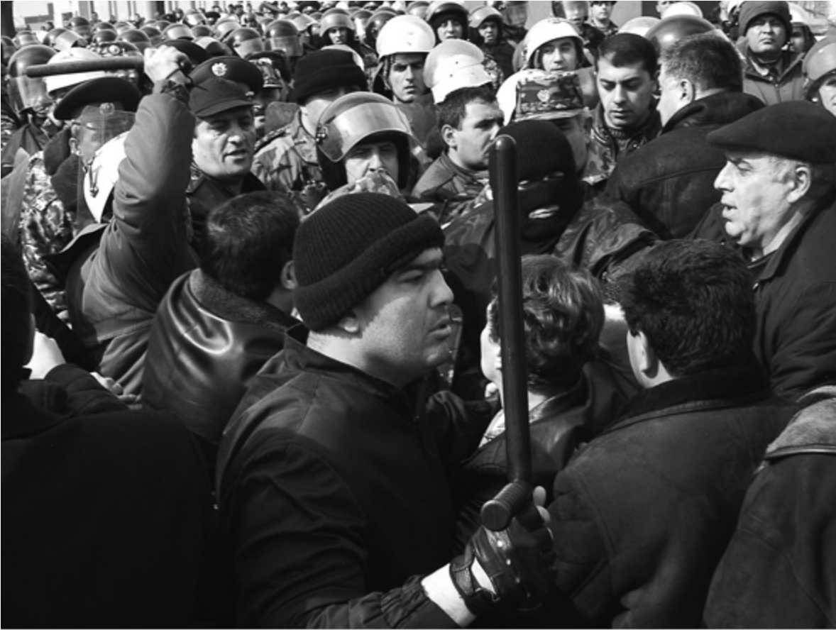
Opposition supporters protest the results of the 2008 presidential election and clash with police in Yerevan, Armenia. On this day, March 1, 10 people died and more than 200 were injured.

'In Armenia, the shutdown of AI+ was a valuable lesson to all nonstate-run TV companies in showing what happens to a company that acts in ways considered to be unloyal to the government.'