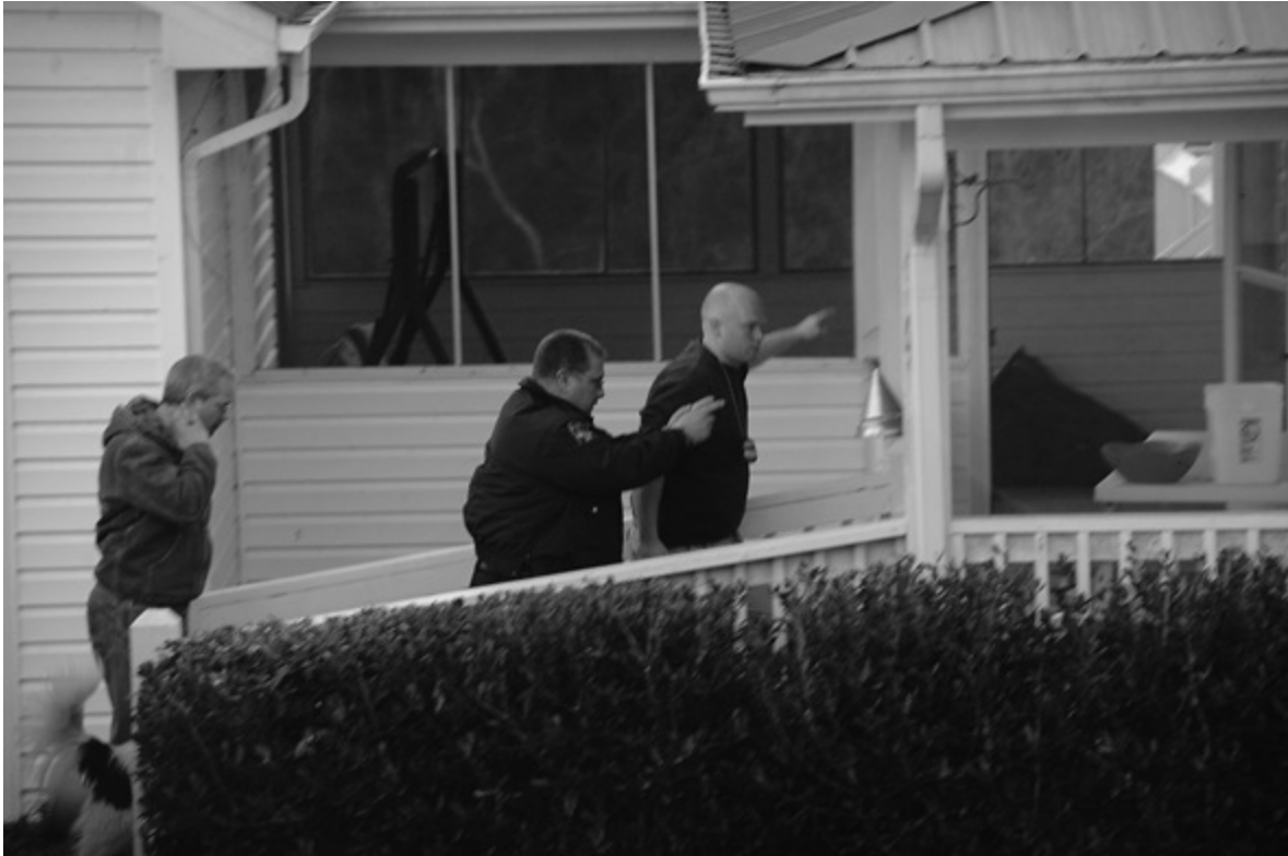
Citizens of Kozyn, Ukraine, speak with a representative of the federal government in 2004 during a dispute over control of a valuable piece of land.