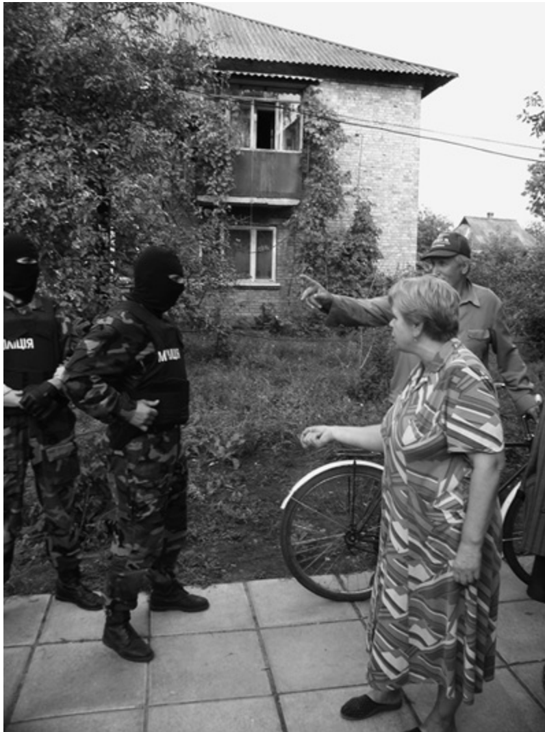
Citizens confront masked police officers outside the village council office in Kozyn, Ukraine, over a land dispute in 2004.

'If we decide to pursue the story, they [lawyers] guarantee a lawsuit will be filed in London, the libel capital of the world, where the burden of proof is on the defendant—the journalist and his newspaper.'